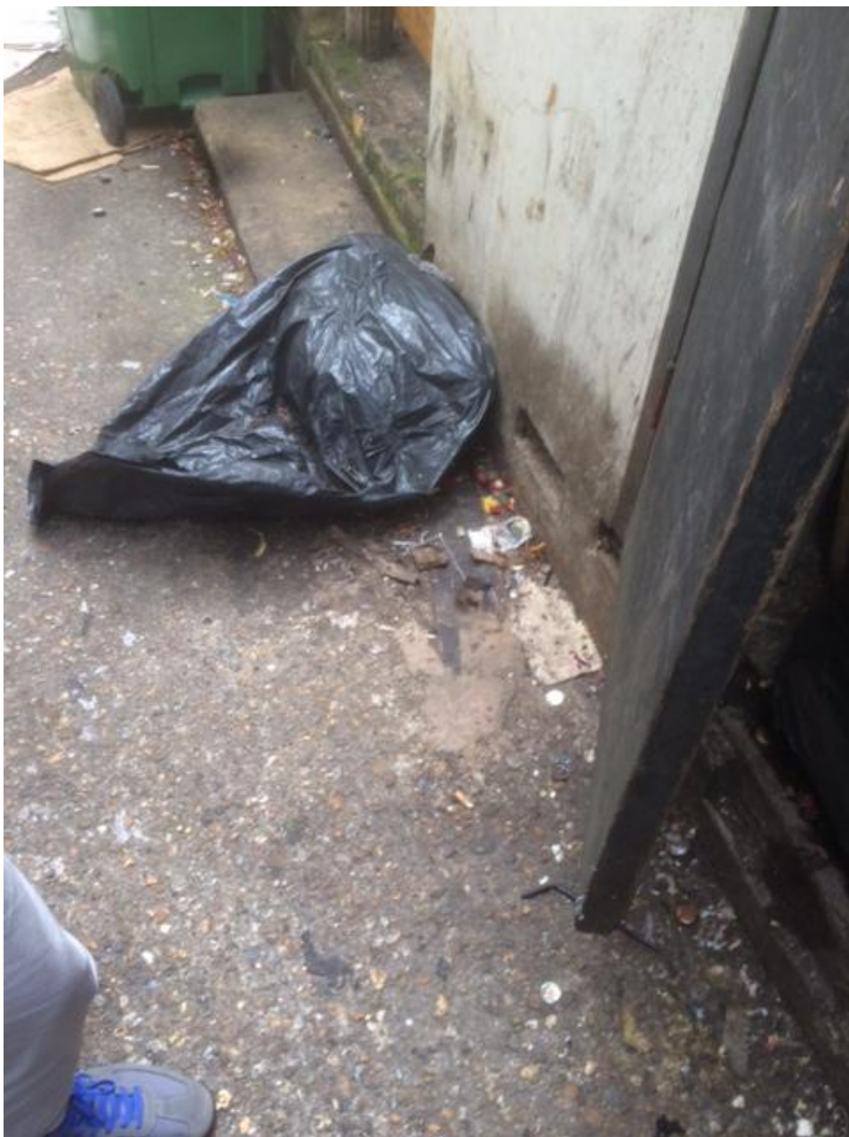
"PoNaNa rubbish left in alleyway"