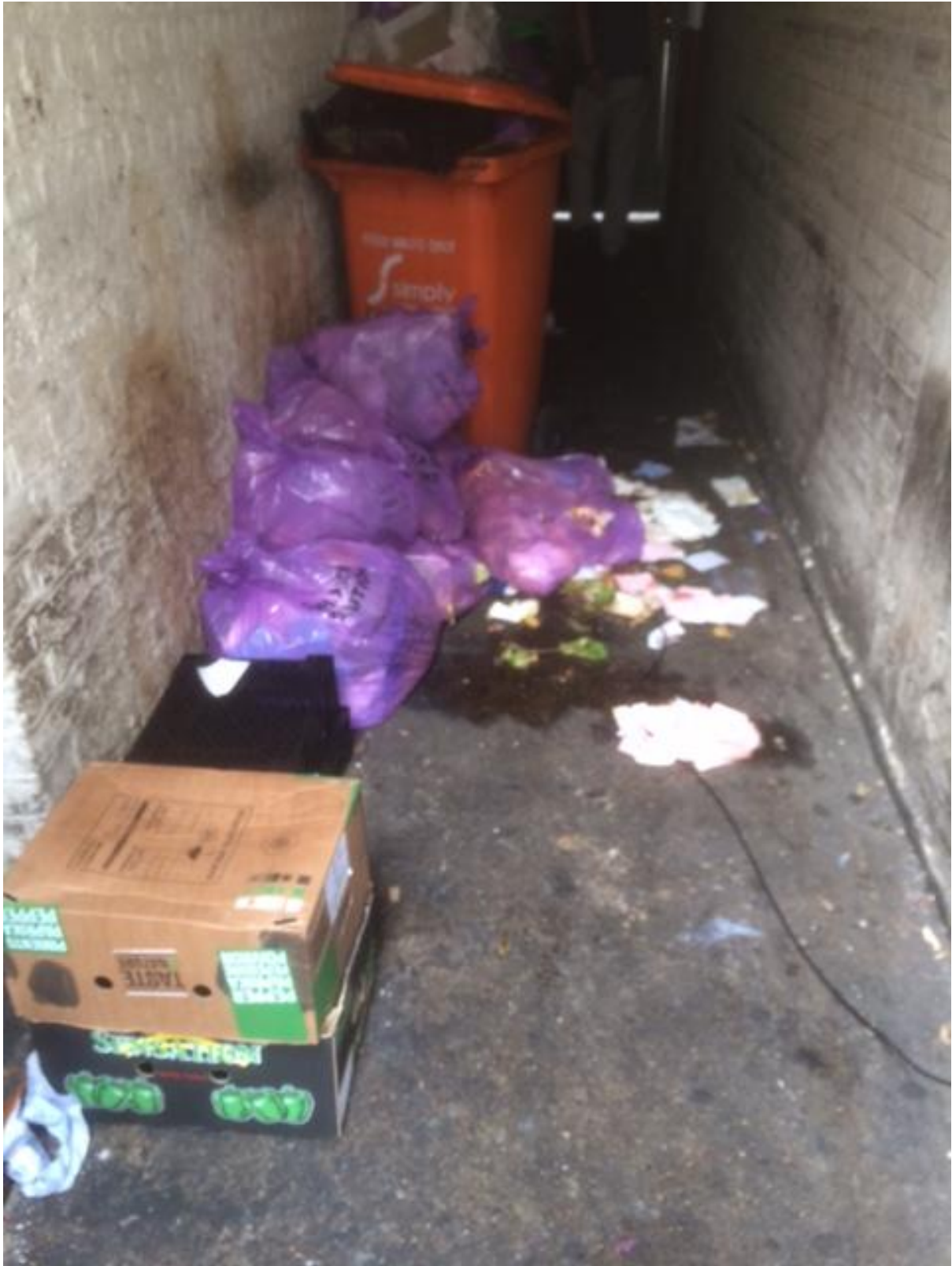
“Filthy access alley to access drains for 1B Kings Rd”