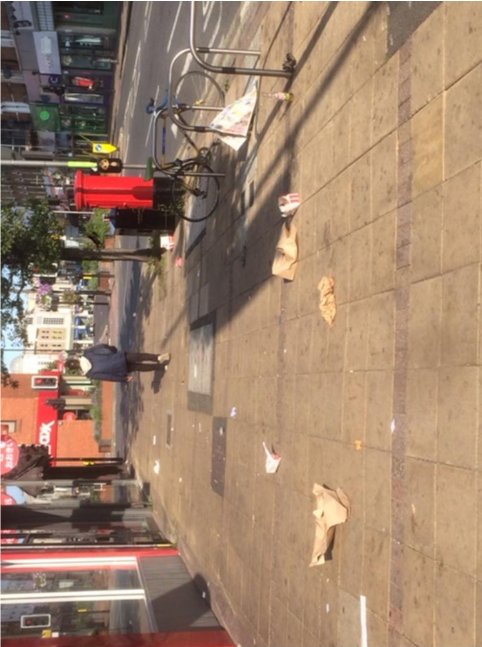
Photograph submitted by WEHRA – “Street scene local residents have to put up with”