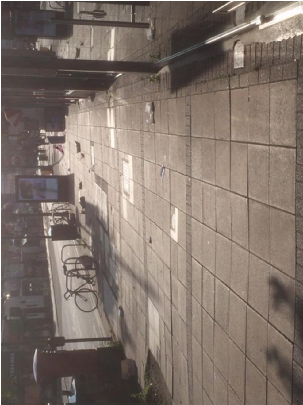
Photograph submitted by WEHRA - "Sunday morning across from PoNaNa"