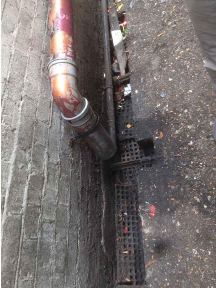
Photograph submitted by WEHRA – “Drain for another business used by Po Na Na”