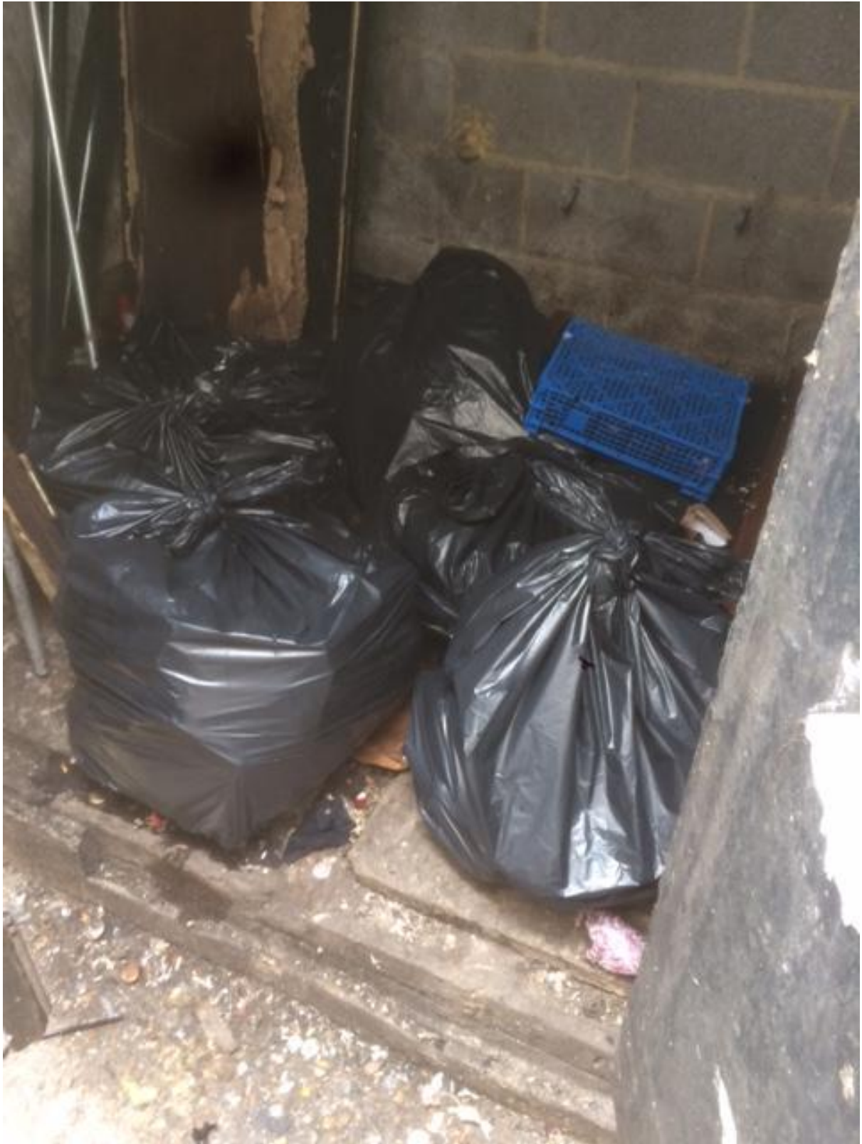
"Rubbish from PoNaNa in unsecured shed"