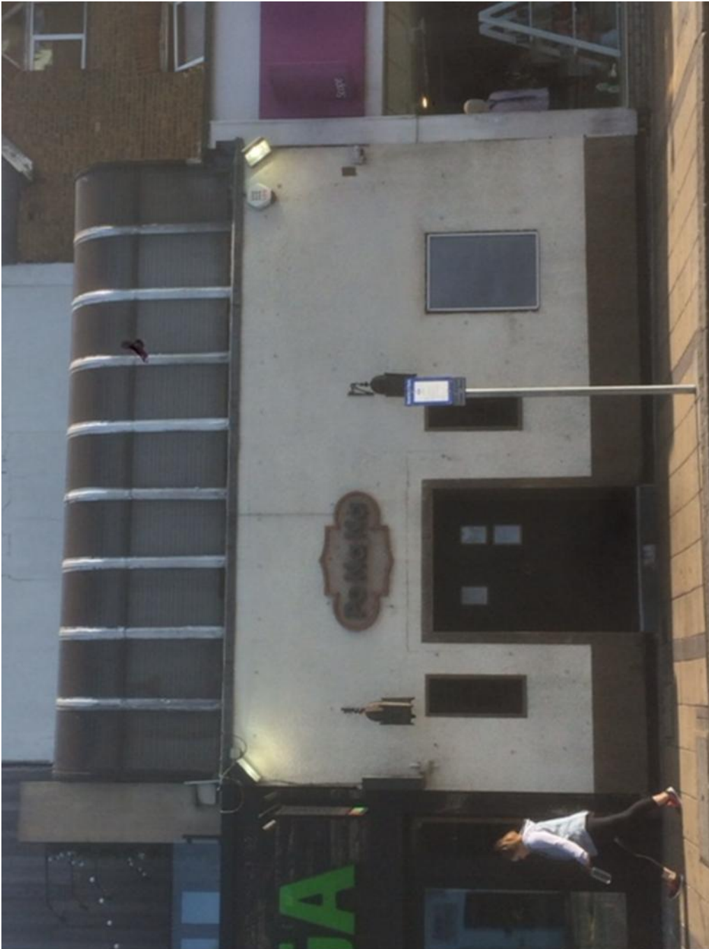
"PoNaNa current front with filthy dirty first floor"